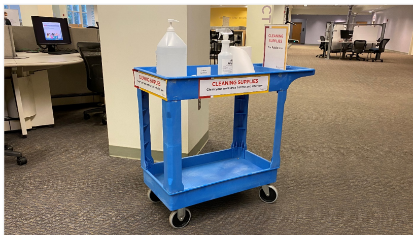
Blue, point-of-use cleaning carts were distributed throughout HSHSL