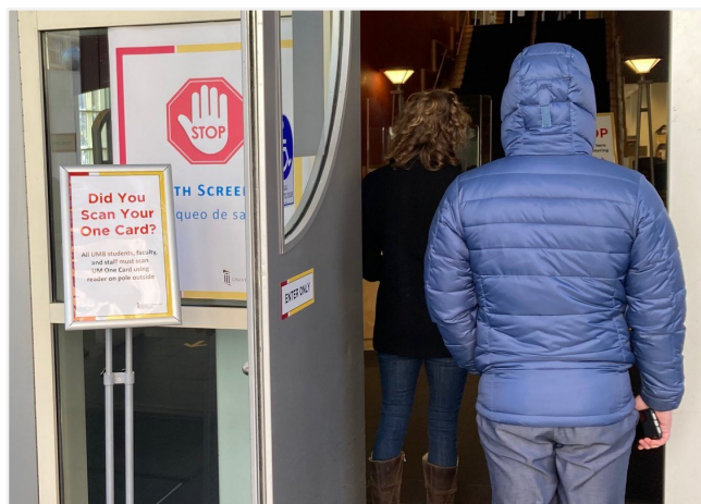
HSHSL served as the entrance to UMB's vaccine clinic

At the beginning of FY21, the HSHSL building remained closed to the UMB campus – but we were not idle. Our COVID-19 data dashboard tells the story . The building reopened on September 14, 2020, to UMB and UMMC patrons. We were delighted to see people returning to use the physical space.